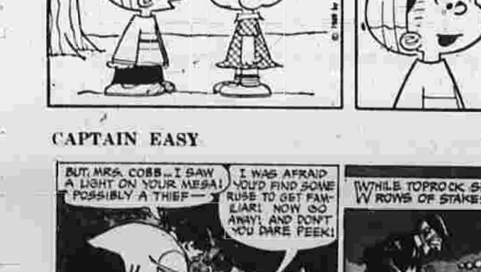
LITTLE SPORTS BY ROUSON