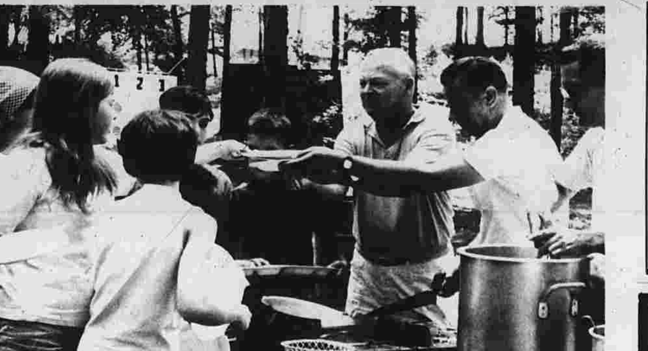
One Cookout Rains Didn't Wash Out

If you can thread a needle... you'll want to see our Fabulous Selection of FABRICS More than a HALF MILLION YARDS of the World's Finest FABRICS LOW MILL PRICES Woolens • Suitings • Dress Fabrics Drapery & Upholstery Fabrics Linings • Patterns • Notions • Trimmings Custom Draperies & Slipcovers Come see for yourself... the big, wonderful, colorful selection of the finest fabrics from all over the world... all at Pilgrim Mills Low MILL PRICES. We know you will agree that the new Pilgrim Mills is the same Mills... ONLY BETTER.