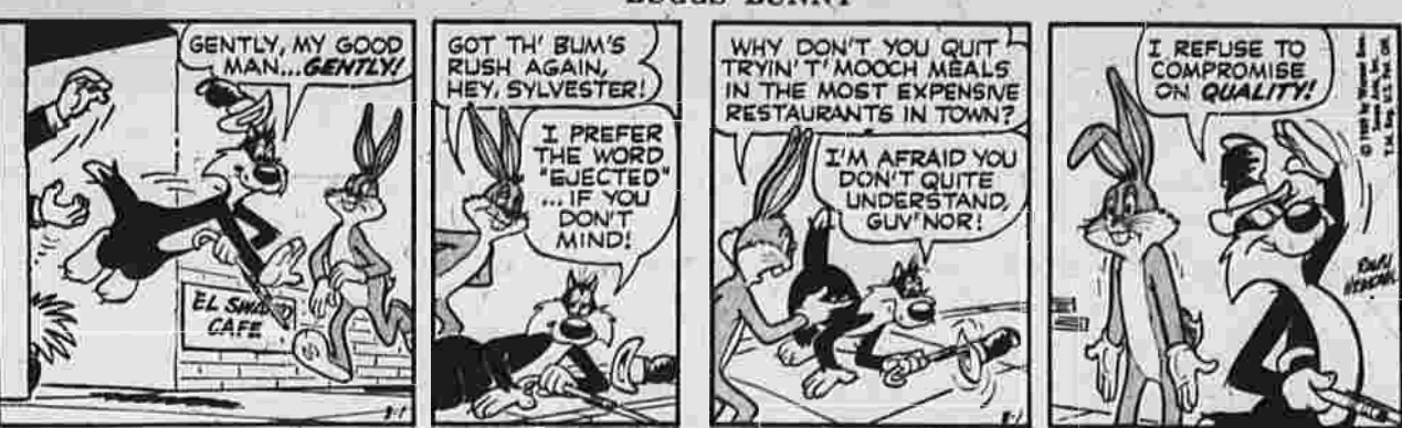
BUGGS BUNNY BY V. T. HAMLIN