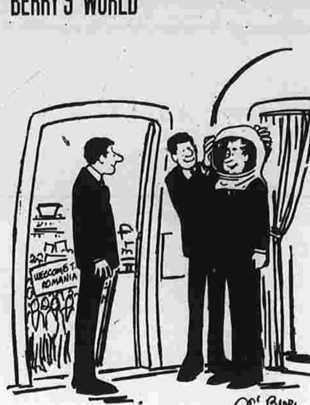
"I know it's a great idea, but I wonder if it isn't a little too obvious."