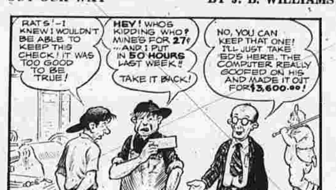
OUT OUR WAY BY J. B. WILLIAMS